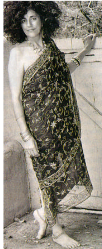
Right: Artist Janet Saad-Cook (b. 1946). Front: Saad-Cook, Distillation (Unmounted) , 1988, as seen in the artist's studio.

coatings that break the light into pure colors. When she first started making Sun Drawings she used mylar, iridescent plastic films, and Du Pont's Kapton, a transparent gold polyimide film used to insulate